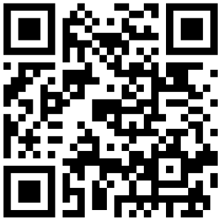
Robertson Tourism Website